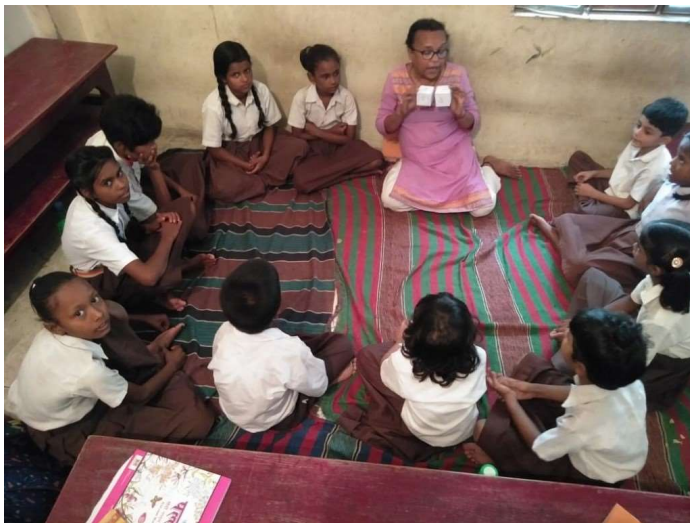
Neeta Ma'am using "dice" to teach reading