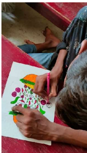
and some learning to draw.

Kids are kids all around the world. Although I chuckled when I saw this photo, I'm pretty proud of this boy. Although he and his twin brother had been in 4th grade in their previous school, they were unable to recognize all the letters when they came for admission in Asha Deep in