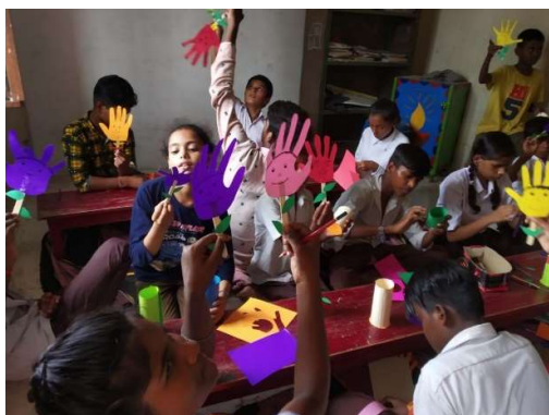
Some kids in craft class,

students until 3 p.m. This gives us time to add some extras into our schedule like library time, occasional outdoor games supervised by class teachers, weekly general knowledge quiz time, and weekly art classes. Every Wednesday our students attend either craft, drawing, dance, or tabla (Indian drum) classes, an enriching break from purely academic learning. We've really missed these activities the last two years!