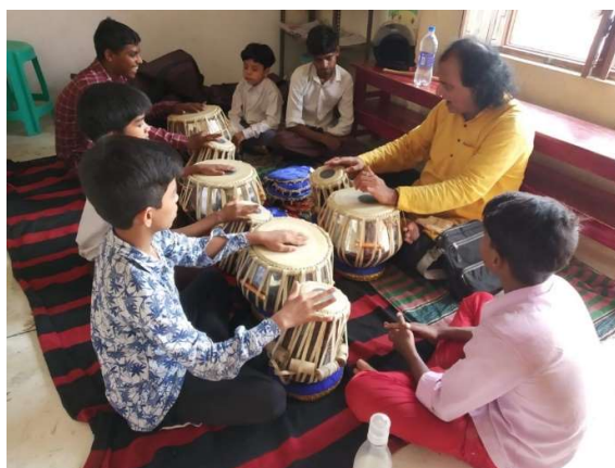
some learning tabla,