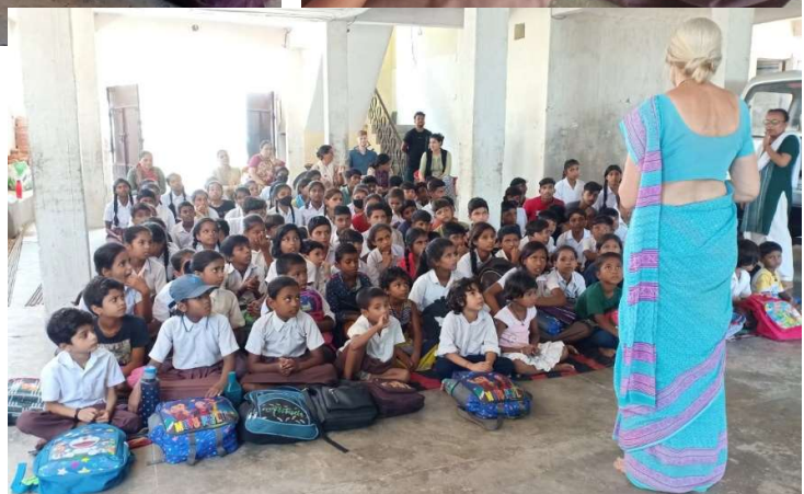
The whole school is finally allowed to assemble! Here the children are waiting to hear who has won prizes for projects completed during the summer break.

their summer homework packet, students could choose to work on a special project: write an essay, create a compendium of jokes, choreograph a group dance, make a labelled flower or leaf collection, make something out of used materials, or sculpt something from clay, for example. Prize distribution was our first special gathering of the year.