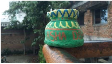
Two of the summer competition clay item submissions