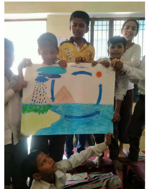
Our 3rd graders made a chart showing the water cycle